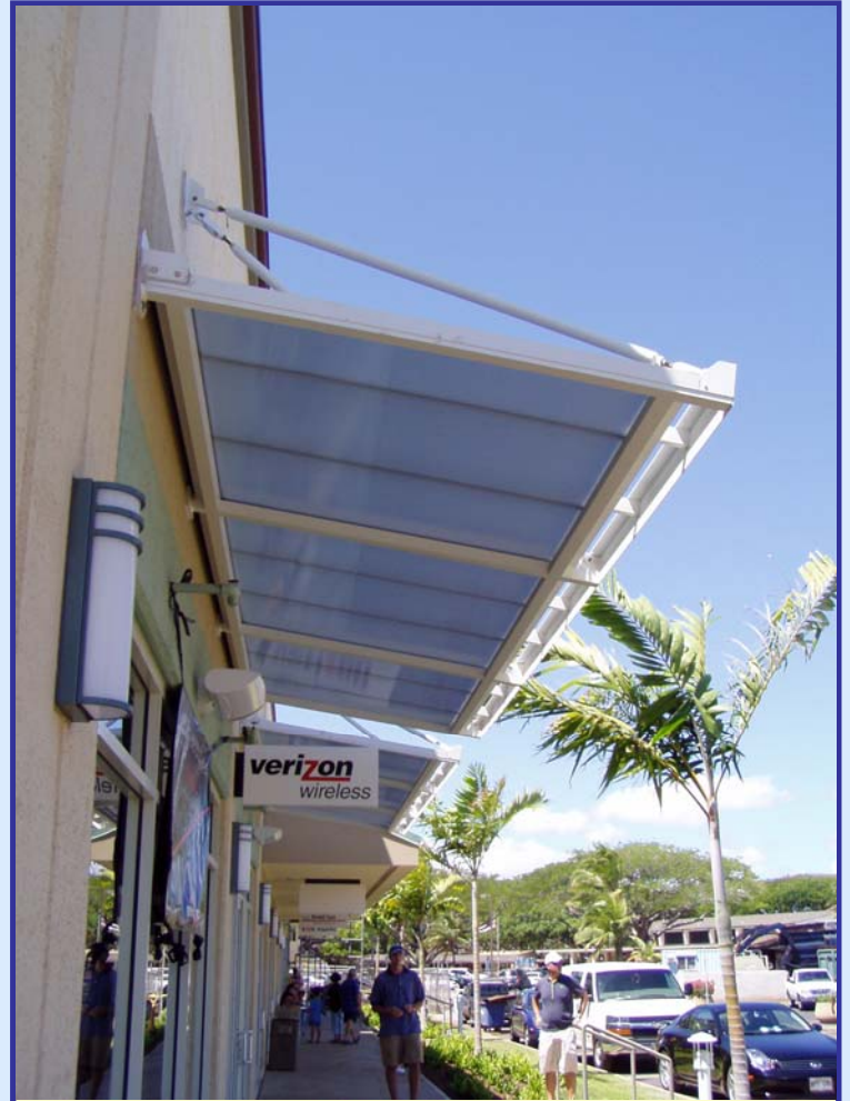
The Moanalua Shopping Center in Honolulu, Hawaii, is nicely accented by CPI's LiteBrow™ Suspended Light Transmitting Canopies. CPI shipped 17 LiteBrow™ Canopies each five feet wide by seventeen feet long with Pentaglas® glazing.