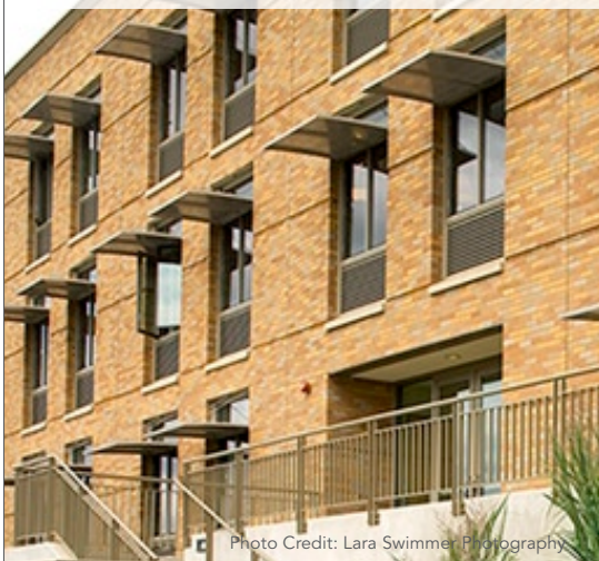
Exterior of Annunciation at Mount Angel

Daylighting. The team sought glare-free, evenly distributed daylight in all rooms during 95 percent of normal occupancy hours. Based on studies of classroom lighting levels in other countries, the U.S. and their prototype classroom, they aimed for a minimum-maximum range of 20-40 footcandles at four percent daylight factor.