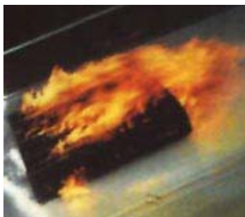
ASTM E-108 Burning Brand Test on Quadwall “Class A”