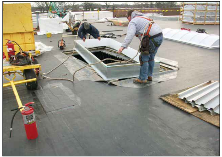
(2) LOCATE NEW STRUCTURAL ROOF CURB OVER TWO BAR JOISTS AT NEW OPENING