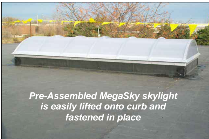
(5) FINAL INSTALLATION OF CPI MEGASKY OVERSIZED SKYLIGHT ON STRUCTURAL ROOF CURB