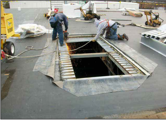
(1) CUT NEW OR EXISTING DECK OPENING WIDTH TO BAR JOISTS AND LENGTH TO NEW STRUCTURAL ROOF CURB