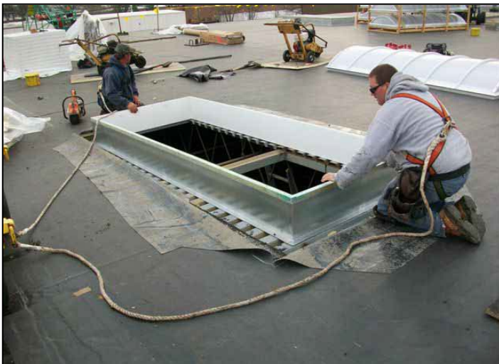
(3) NO REINFORCING ANGLES REQUIRED WHEN STRUCTURAL ROOF CURB SPANS TWO BAR JOISTS