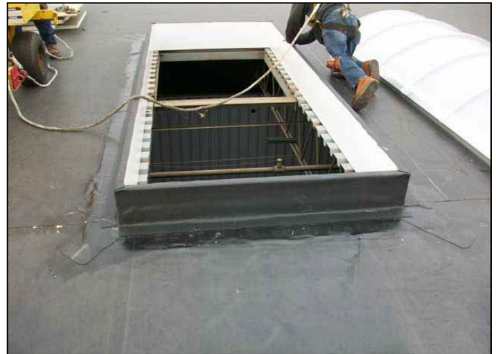
(4) STRUCTURAL ROOF CURB ROOFED IN